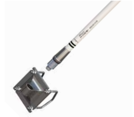
Kit Includes: Antenna, Rubber waterproofing shield, Mounting bracket, U-bolts, Hardware for U-bolts (Screws for bulkhead mounting not included)

Built for maximum performance, this 4' broad band antenna is designed to endure the harsh environment and communication requirements in commercial, law enforcement and disaster management applications. Whether you install it on a vessel, base station, or a stationary platform, this antenna provides a host of mounting options to fit your need. No tuning or ground plane required. Cable not included.